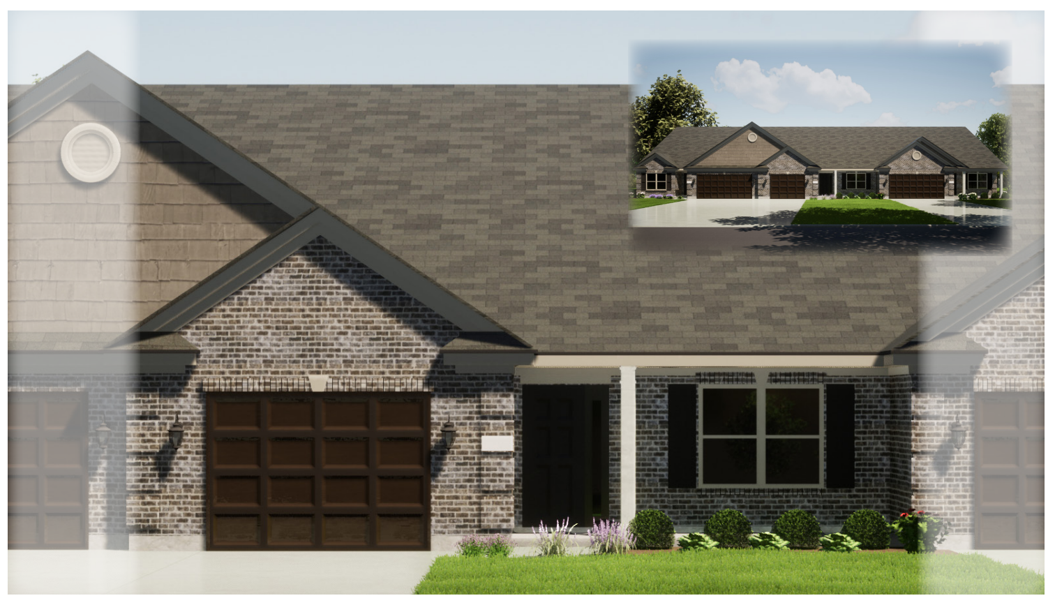
* Exterior elevation and colors may vary.

1174 Waterloo Street Troy, OH 45373 Middle Unit - Plan F